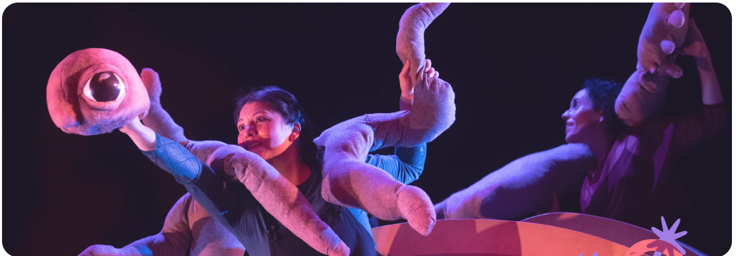
Archipelago